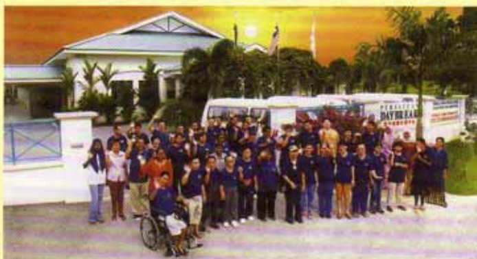
▲ ... ONE BIG HAPPY FAMILY (Administration, Production & Training Departments)

In 1992, there was a dream to provide job skills training for people with disabilities so that they can find meaning in life through being gainfully employed. That dream was to come true in a way that is worthy of any imagination, in the form and function of Daybreak.