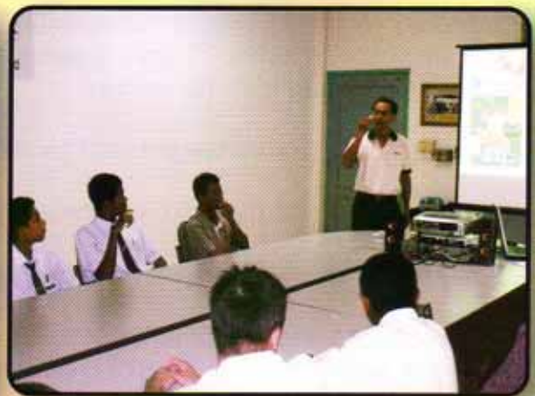
▲ Pupils attending training session

Earlier this year, an official Work Experience Programme was implemented in several special schools as a follow up to the successful pilot project. Through regular vocational training incorporated into classroom sessions, this innovative one year programme provides pupils with the necessary job knowledge they need before they are exposed to "real work" in the outside world. Dedicated teachers under the guidance of experienced Daybreak trainers are always quick to identify methods that can be incorporated into the classroom, thus enabling more comprehensive and relevant training to more pupils.