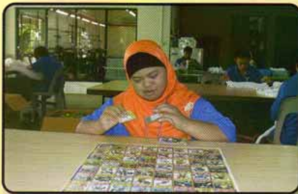
▲ Contract Assembly & Packaging

The entire batch of ten pupils in this programme have since successfully completed the first year of training. Entering into their second year, an "Individualised Vocational Training Plan" is used to determine individual strengths and inclinations of each one of the participants. Pupils are evaluated based on performance, capabilities, interests and even family expectations, and equipped with the necessary skills accordingly, so as to enable them to be successful in seeking gainful employment eventually.