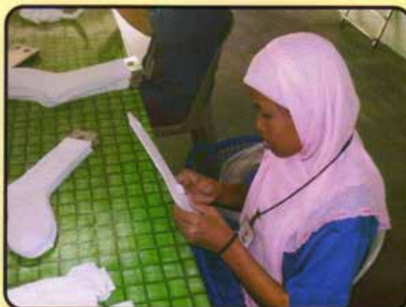
▲ Socks Manufacturing