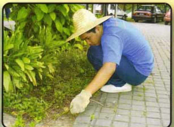
▲ Plant Nursery