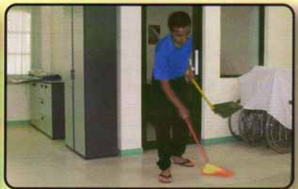
▲ General Cleaning