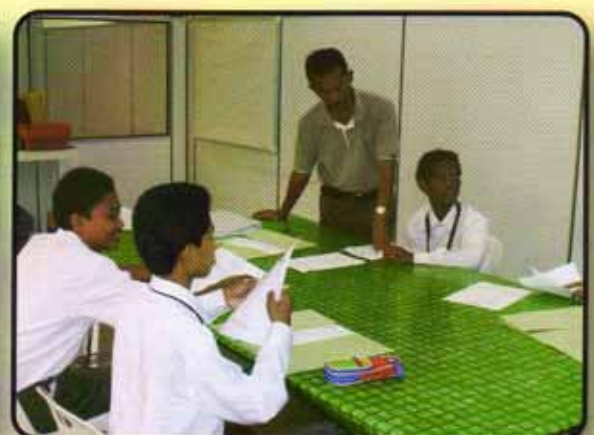
▲ Pupils involved in interaction & documentation