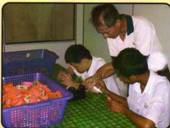
▲ Work skill session in progress

Upon successful completion of the programme, pupils may directly participate in Daybreak's Vocational Training Programme, which not only trains and equips young people for work, but also helps them find jobs that are most appropriate for them.