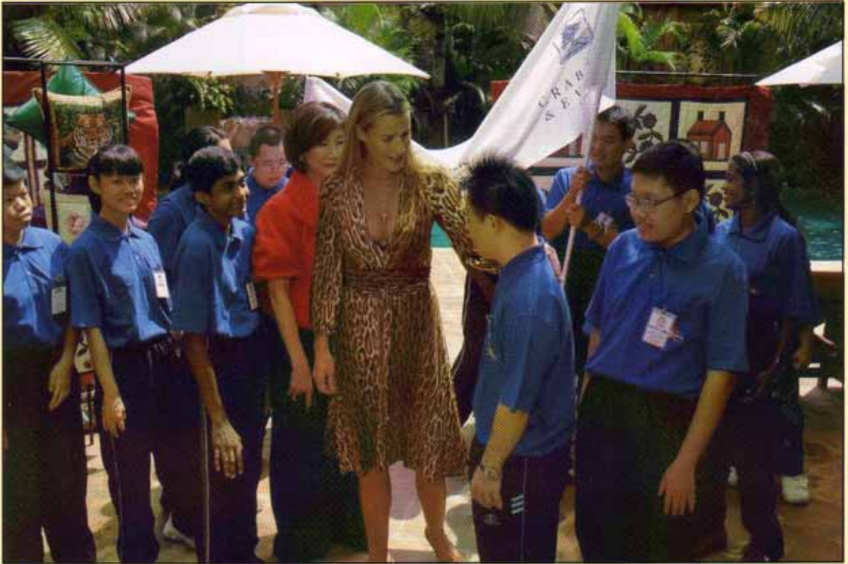
▲ India Hicks spending some time with our trainees during the launch of her Island Living range

In conjunction with the launch, Crabtree & Evelyn also announced that a percentage of sales from all Malaysia stores in the month of July will be donated to Persatuan Daybreak to help fulfill the dreams of the disabled to live a life with purpose and dignity.