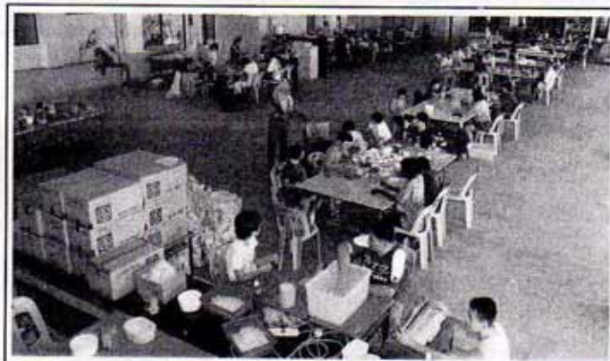
Our Training Workshop

Drivers cum training helpers. We have three vans which provide transport for our trainees and some staff members. The drivers also help out in this department whenever they are free.