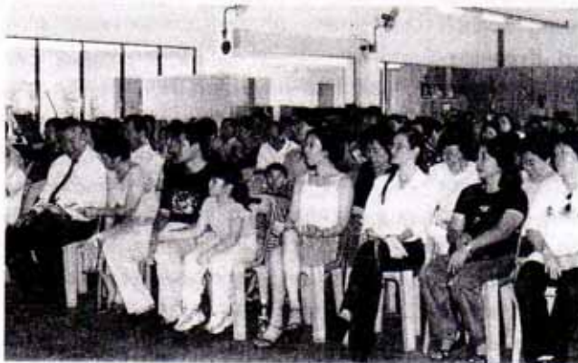
Guests at the Blessing Ceremony

Testament. In the sheep pen, 'e shepherd functioned as a gate to let in the sheep and to protect them. Jesus Christ is the gate to God's salvation for us and He is also our protector.