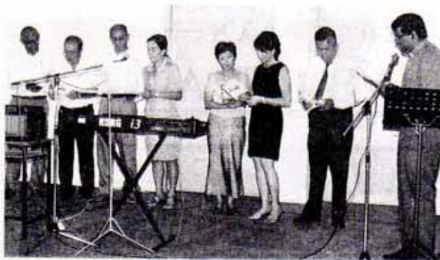
Declaring their commitment to serve

They are provided transport to and from the Centre in our vans and are taught new skills to help them to regain their self-esteem and get employment. They are then able to integrate into society and some of