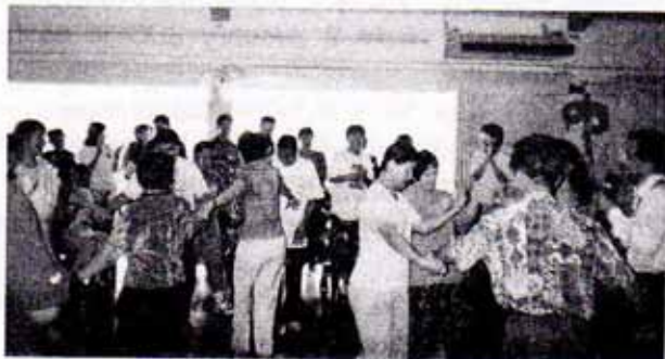
Dancing to lively music