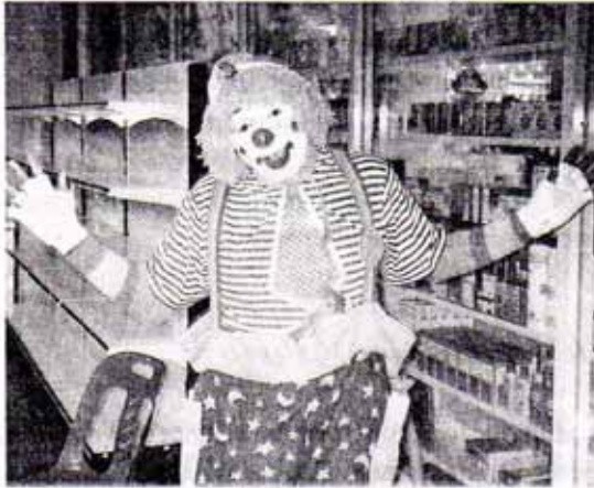
Spotty the Clown

Then we had an enjoyable buffet dinner of a variety of delicious food that were mainly donated by some generous donors.