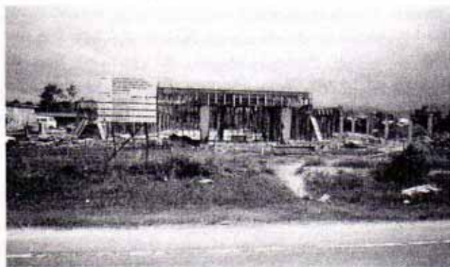
New Building under construction

Daybreak Centre has been housed in a rented shop at 64, Jalan Bandar Timah, Ipoh since its inception in 1992. However, due to the increase in the number of trainees, the Training Department was shifted in 1993 to a temporary premises at the Perak Waterworks Store in Gopeng. The Management Committee of Daybreak has decided to centralise its operations in order to provide better facilities for the disabled people. The Administration, Production, Sales and Training Departments will be located at one site. An anonymous benefactor has donated an acre plot in Pengkalan, Lahat for this new building. The estimated cost of this building is RM 1.5 million. We still need to raise RM 1.2 million to complete this project and appeal for sufficient funds to be available for a satisfactory completion of this new building. We would be grateful for any amount donated. Cheques / Money Orders should be crossed and made payable to Persatuan Daybreak.