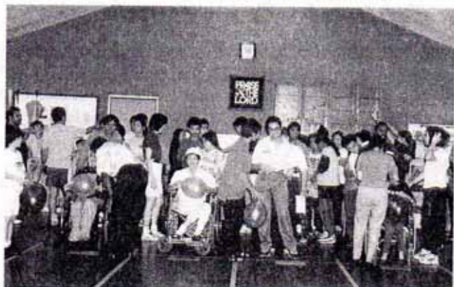
Start of Balloon Relay