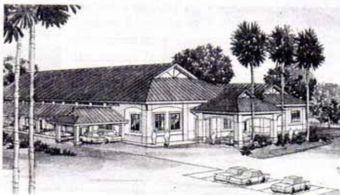
An Artist's impression of Proposed New Daybreak Centre