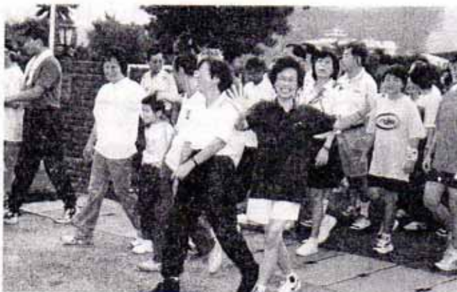
Some Happy Walkers

The participants for the walkathon started from the Church and went along Jln. Keliling, Jln. Dato Lau Pak Khuan, Jln. Kompleks Sukan, Leboh Cecil Rae, Jln. Lee Kwee Foh and again along Jln. Keliling before returning to the Church and finishing the walk.