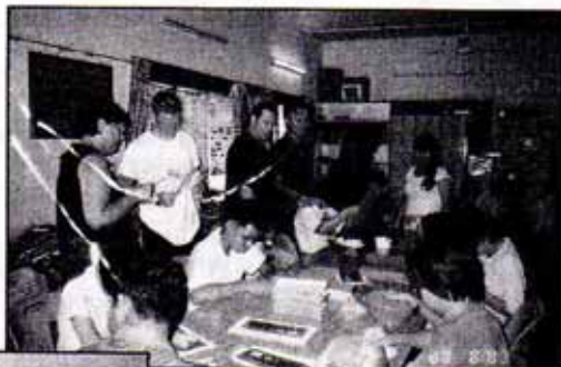
Visitors at the Training Centre