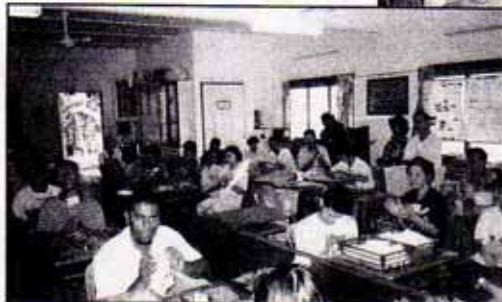
Trainees clapping hands to music