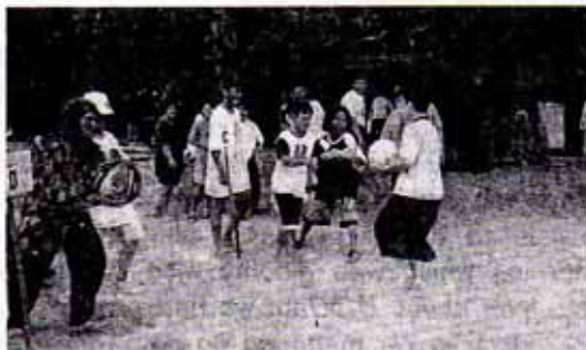
Passing a Beachball Relay

The weather had changed by 1pm and it was a fine afternoon with clear blue sky. We had finished our pleasant lunch and the sea looked very inviting. Soon most of us were swimming and enjoying ourselves. Even the few reluctant ones with walking aids were helped by staff members. They also joined in the fun by wading and playing in the cool, clear water. We stopped at 3pm to change and to pack up our belongings. Some reluctant trainees had to be coaxed to leave the seaside and board the vans for the journey back to their homes. Everyone had an enjoyable picnic at the beautiful beach.