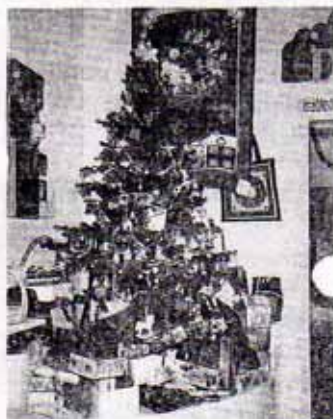
Happy Shopping at Daybreak

Donations: We would be grateful for any donation to us. Cheques should be crossed and payable to Persatuan Daybreak.