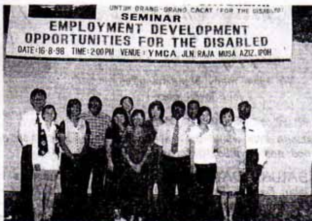
Facilitators and Daybreak members

The seminar ended at 6.15pm after an interesting Questions and Answers session. It has increased our concern for the need of the disabled to be gainfully employed.