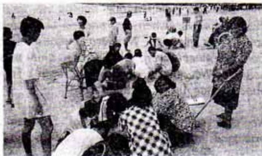
Building Sand Castles