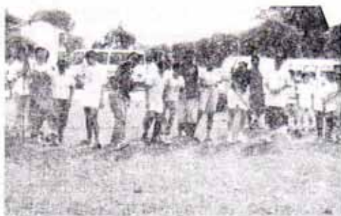
Start of three-legged relay

The first event was the Three-Legged Relay. There were 6 pairs in each team. Each pair had one leg of a trainee tied by a piece of cloth to one leg of a volunteer. This was followed by Banana Eating Relay where ten members of a team ate a banana each consecutively. The next item was the Egg Balancing Relay. Each member of the team had to run with an egg balanced on a spoon to the other side and pass the egg to the next runner. The four teams had five participants on either side. The wheelchair bound player was the first participant and was pushed by a helper.