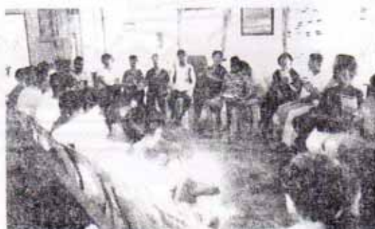
Singing during fellowship

people will have an opportunity to be gainfully employed in firms or factories.