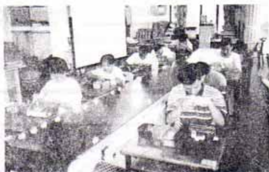
Using the mini conveyor belt

The training programme for the physically and intellectually disabled is over a period of two years. The trainees are introduced to the habit of punching individual cards for beginning work at 9.00am and when they finish work at 4.30pm. The training is from Monday to Friday. They have a fellowship period from 3.15pm to 4.15pm every Friday afternoon. They enjoy themselves singing and playing games during this session. The Centre accepts male and female trainees who are 14 years and above. We provide transport both ways in our vans for our trainees from pick up points in Ipoh to the Training Centre in Gopeng. After completing their 2 year programme these special