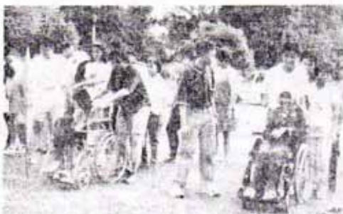
Egg balancing relay

The fourth event was the "Guni" Sack Relay. There were some very agile players who excelled in this race. The last event was the Shoes Scramble Relay which turned out to be very hilarious. Each team had 8 players. Each participant had to remove one of his or her shoes and this collection of 32 shoes were mixed and placed in the centre of the field. Each player of the team had to run consecutively to the pile of shoes and put on his or her shoe before running back to team. This process continued until the last player had put on the shoe and had run to the finishing line.