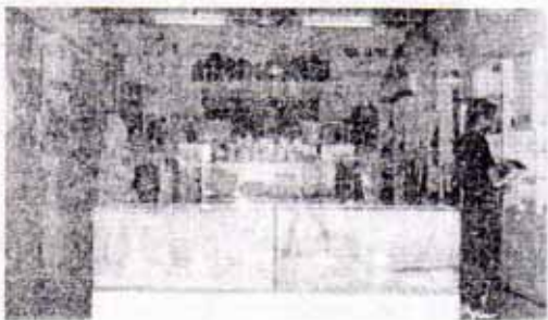
Happy Shopping Daybreak