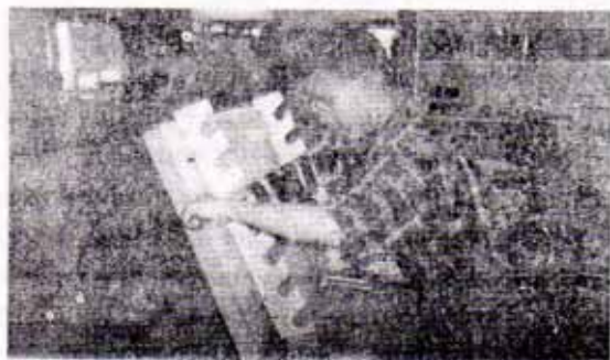
Trainee using a Work Station equipment