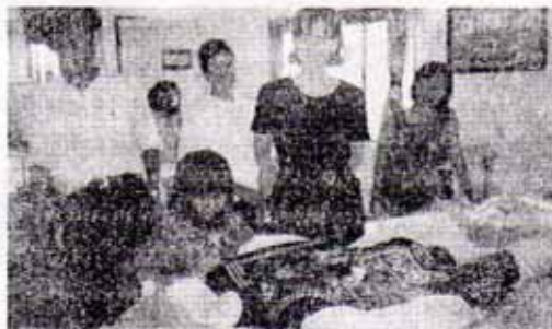
Our Visitors at Training Centre

They were particularly interested in the use of the Work Station for different exercises and were impressed by the monitoring and records kept for each trainee. The following day, 20 January 1998, they also visited our Daybreak shop in Ipoh. They were keen to see the wide range of beautiful hand-crafts made by the disabled people. They commented favourably on the standard of craftsmanship. They wrote to Daybreak on their return to inform us that they were pleased with the results of our work at Gopeng Training Centre as well as at our shop. They are also glad to see that Canada's contribution to our organization is being used to its fullest potential.