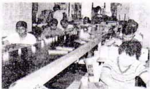
A Work Session