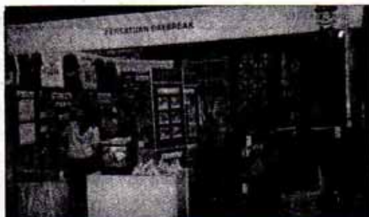
Daybreak booth in the stadium

Malaysia. The Expo was held at Stadium Negara, Kuala Lumpur from 19-21 September 1997 and it was open to the public from 10a.m. to 10p.m. for the three days. Thirty booths and eleven display stands were set up by various participating groups in the foyer and arena of the stadium.