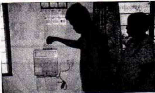
Using punch cards at Training Centre

Applications are invited for the new intake in January 1998 at the Training Centre in Gopeng. We accept disabled people, 16 and above in age, who can benefit from our training. Transportation is provided both ways for the trainees from pick up points in Ipoh to the Training Centre in Gopeng