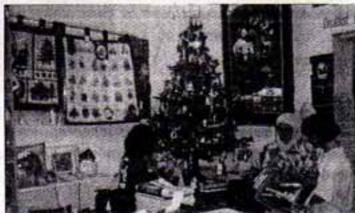
Happy Shopping in Daybreak

We have many beautiful Xmas gifts on sale --- pouches, cushion covers, stocking, table mats, fridge magnets etc. There are also many items for Xmas tree decorations at our shop. Besides buying gifts that are beautiful and well made you would also be helping some disabled people.