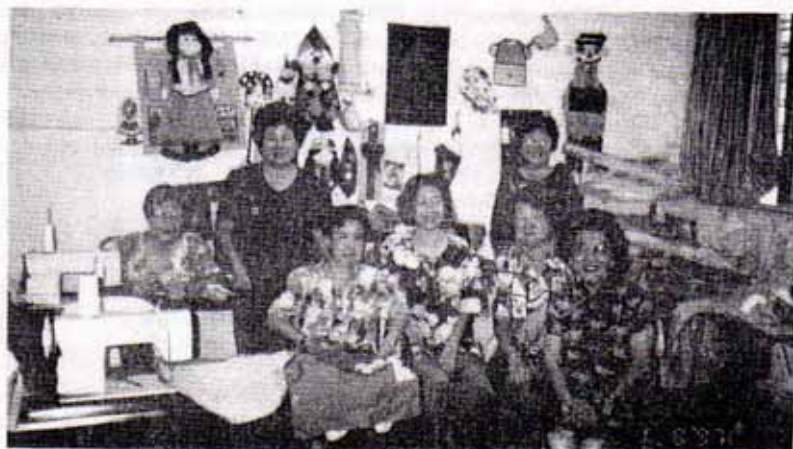
Some Daybreak Volunteers

We praise the Lord for these committed volunteers and their invaluable service for the handicapped.