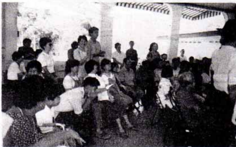
Guests at the Social Day

There were many happy faces and peals of laughter as the trainees enjoyed themselves. This simple gesture of love and care shown to these special children of God would give them more confidence in themselves and add some joy to their lives. Some parents expressed their gratefulness to Daybreak for organising this enjoyable party for their loved ones.