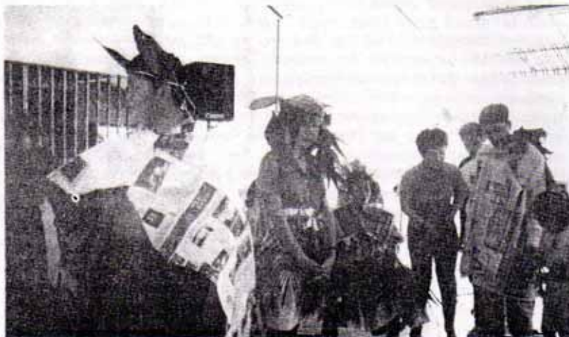
Our fashion models