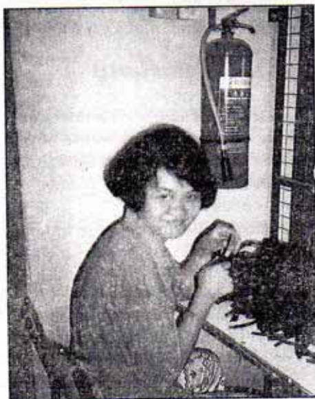
Now, I am independent!